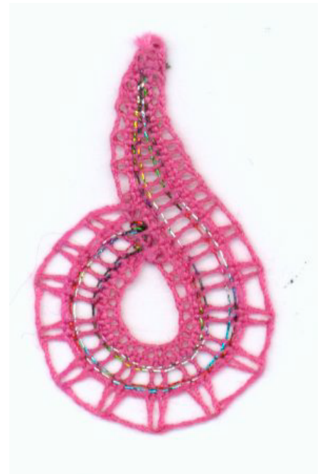
7 pairs Tanne 50/2 size is 3.2 cm(1.25 inches) tall

http://www.tat-man.net/bobbinlace/BLteardrop.pdf